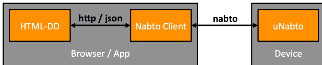
Figure 1: Nabto communication.

The common query interface between the HTML-DD and uNabto device is defined in an XML query model file, which is included in the HTML-DD. This query model defines the communication mapped between the HTML/JavaScript and the low level representation on the uNabto device.